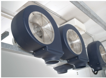
Optional frame-mounted dryer