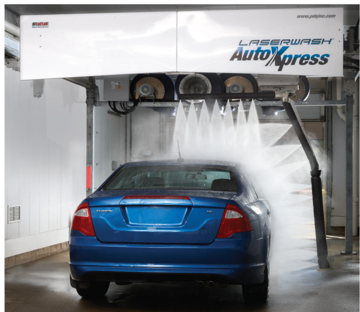
High pressure arch that travels 360° around the vehicle

PDQ's most recognized innovation is the unparalleled Virtual Treadle. This electronic vehicle-sensing technology eliminates drive-on floor-mounted mechanisms, creating a wide open bay that makes it easy for anyone at your dealership to use for either drive-through or drive-in/back-out wash bays. With the open bay design the LaserWash AutoXpress can wash the largest SUVs, vans and full sized pickup trucks, including duallys.