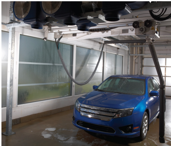
Wide open bay with no drive-on mechanisms